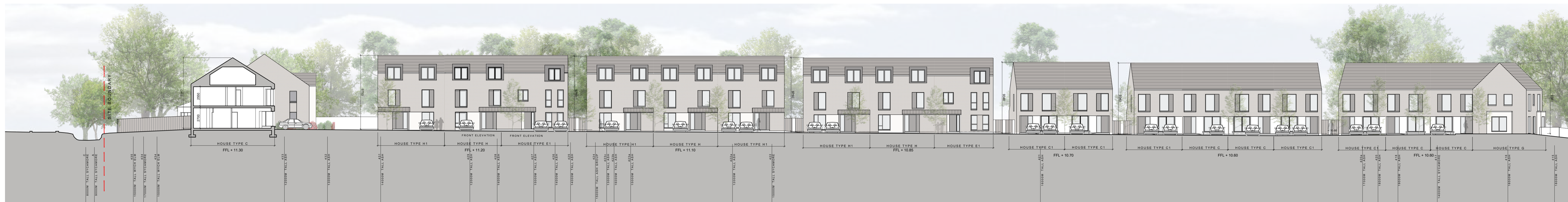
SITE SECTION M - M SCALE: 1:200 NOTE: SEE LANDSCAPE ARCHITECTS DRAWINGS FOR BOUNDARY TREATMENTS SEE ARBORISTS REPORT FOR DETAIL ON EXISTING TREES DOTTED RED LINE INDICATES SITE BOUNDARY