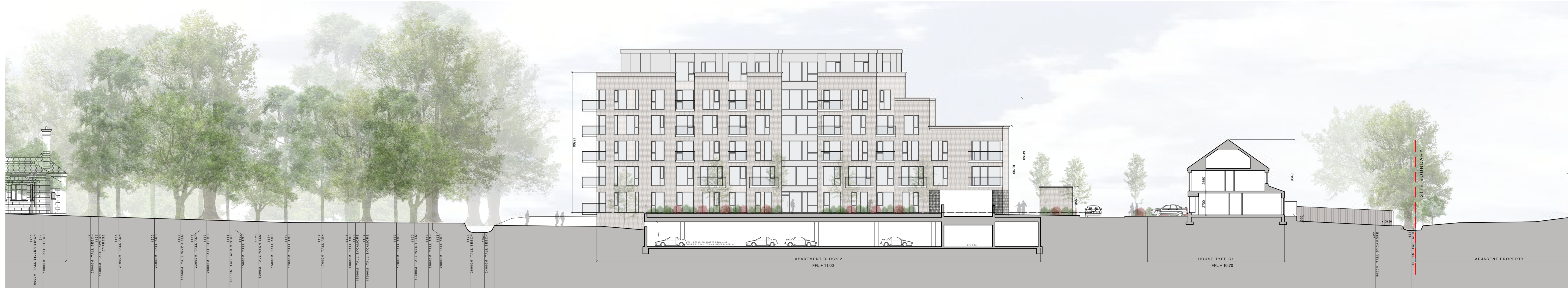
SITE SECTION L - L (PART 2) SCALE: 1:200 NOTE: SEE LANDSCAPE ARCHITECTS DRAWINGS FOR BOUNDARY TREATMENTS SEE ARBORISTS REPORT FOR DETAIL ON EXISTING TREES DOTTED RED LINE INDICATES SITE BOUNDARY