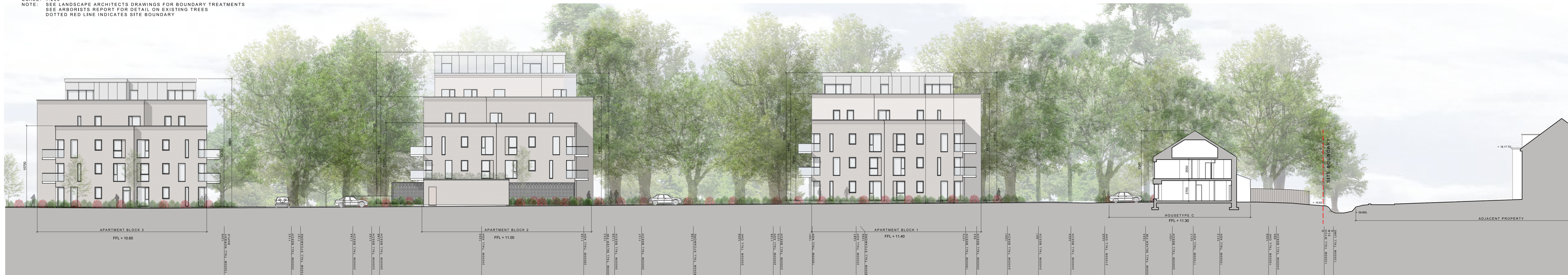
SITE SECTION N - N SCALE: 1:200 NOTE: SEE LANDSCAPE ARCHITECTS DRAWINGS FOR BOUNDARY TREATMENTS SEE ARBORISTS REPORT FOR DETAIL ON EXISTING TREES DOTTED RED LINE INDICATES SITE BOUNDARY